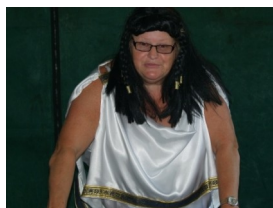
Photo from Toga weekend

If you missed the first issue of the magazine it is now available on our web site just