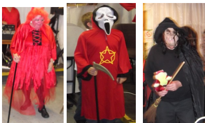
Fancy Dress Winners

difference A special thanks must go to the people who help run the meet.